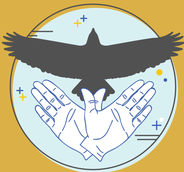
Shadow Art SUN 10 NOV