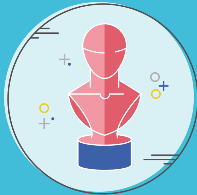
Squidgy Sculpture SUN 14 APRIL