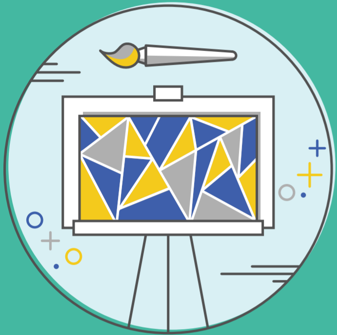
Abstract Canvas SUN 10 MARCH