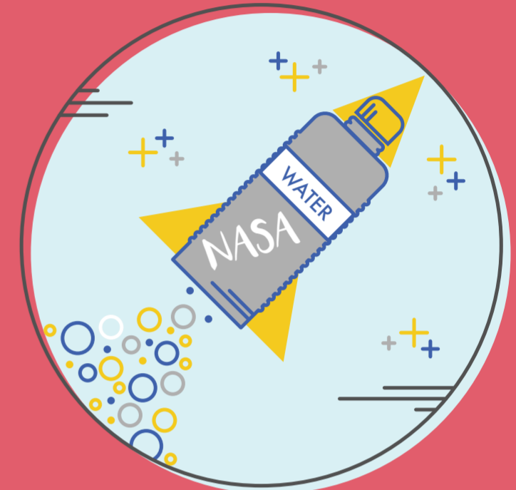
Reuse & Recycle SUN 9 JUNE