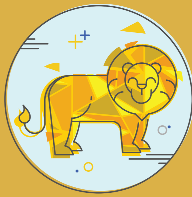
Creative Collage SUN 13 JAN

FREE DROP-IN ART ACTIVITIES FOR CHILDREN AT BROADWAY GALLERY.