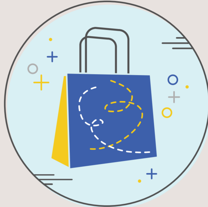
Fabric Fun SUN 12 MAY