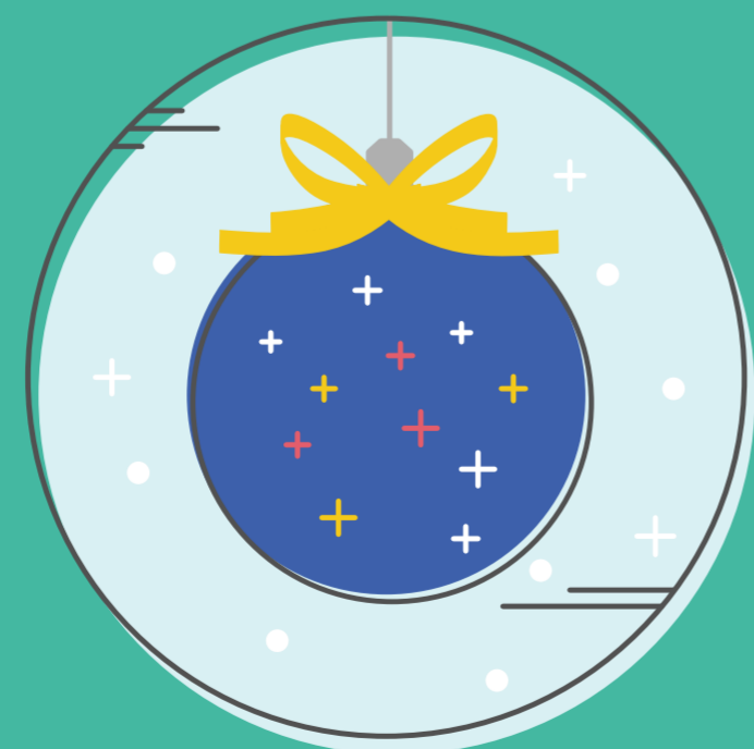
Winter Prints SUN 8 DEC

Bring your little ones to our free Family Arts Studios! Simply drop-in between 10am and 1pm on the second Sunday of every month.