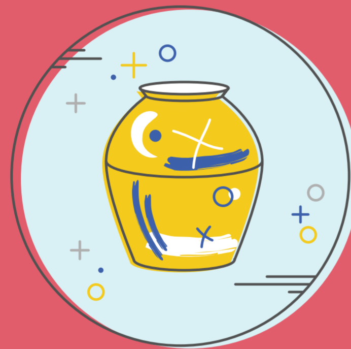
Creative Clay SUN 11 AUG