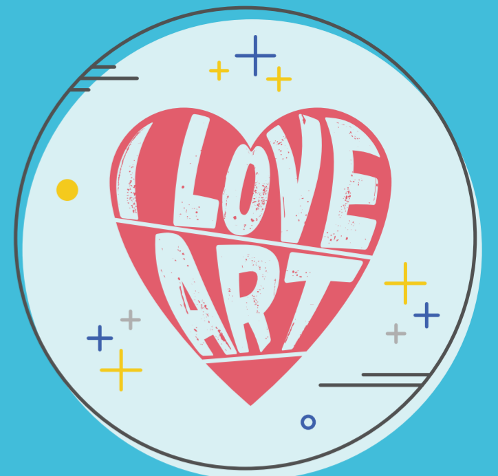
I Love Art SUN 10 FEB