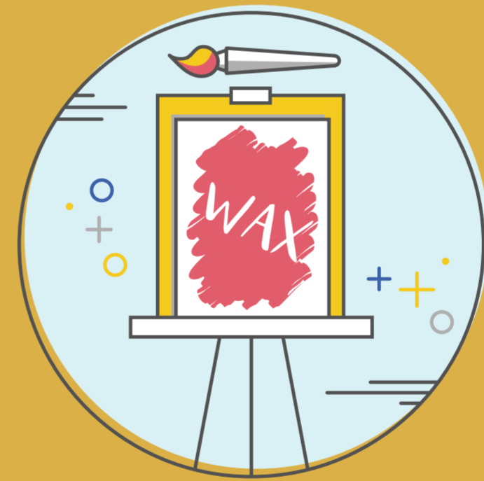
Watercolour & Wax SUN 8 SEP