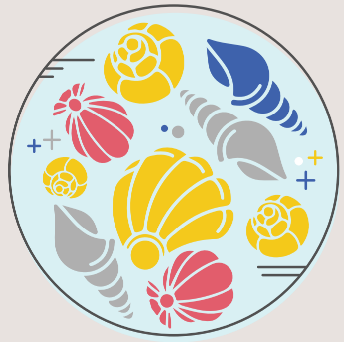
At the Seashore SUN 14 JUL